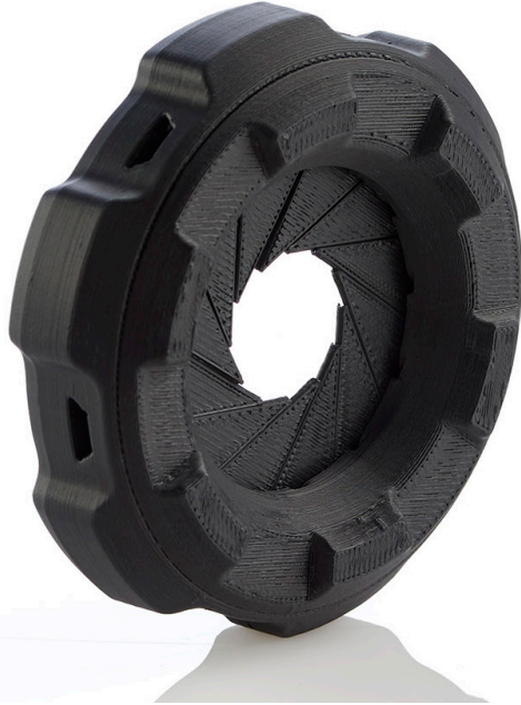
The soluble support capability of Stratasys F123 Printers made it possible to prototype this camera lens cover with an adjustable aperture.

The hands-free removal process also saves labor, making the RP process more productive and efficient.