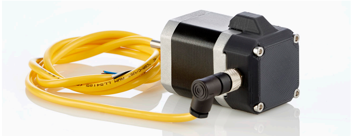
The end cap on this stepper motor was 3D printed to perform functional tests for proper fit.

required a new print head design. Stratasys engineers created multiple versions of the head and 3D printed them. In total, over 20 design iterations were created and 80 head housings 3D printed during the design development and verification stage.