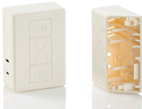
This prototype smart-home switch with fine features was enabled by the 0.007-inch resolution on the Stratasys F123 Printers.

Most 3D printing platforms require trained individuals knowledgeable about printer operation, file manipulation and troubleshooting. The Stratasys F123 Series printers are designed for ease of use, from the initial setup through the design-to-print workflow.