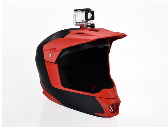
This motocross helmet and the attached red accessories were prototyped and 3D printed using the Stratasys F370 3D Printer.

and provides the ability to refine designs optimally to ensure they're ready for market.