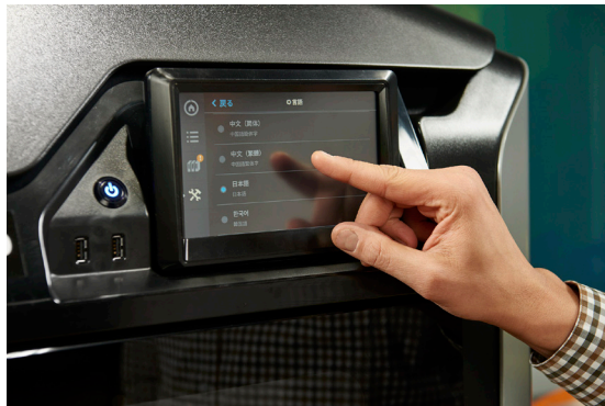
The Stratasys F123 3D Printer touch screen with multi-language display.

Stratasys F123 3D Printers offer multiple features that increase a workgroup's productivity. GrabCAD