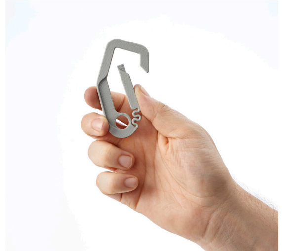
This prototype carabiner design has a flexible living hinge made possible with Stratasys F123 Printer engineering plastics.

More importantly, these 3D printers are designed for the office environment. They use a clean build process with no hazardous chemicals or materials and operate using standard 110-volt office electrical power. 3D printed models are built in an enclosed, insulated build chamber with an auto-locking door for safe operation and no risk of outside physical interference. Noise insulation provides exceptionally quiet operation, under 46 decibels, which is similar to a residential refrigerator.