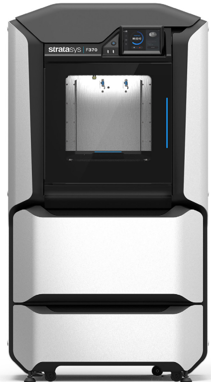
The Stratasys F370™ 3D Printer.

It's no secret that businesses need to quickly respond to changing customer and market demand to stay competitive. Getting a new product out before your competition helps you generate new revenue and maintain market